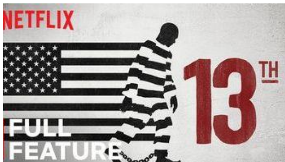
Netflix presents "13TH" (Full Length Feature Documentary)

Combining archival footage with testimony from activists and scholars, director Ava DuVernay's examination of the U.S. prison system looks at how the country's history of racial inequality drives the high rate of incarceration in America.