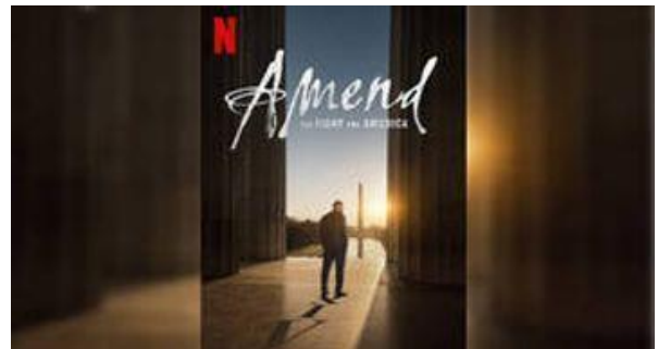
Netflix presents "Amend, The Fight for America" (trailer)

Combining archival footage with testimony from activists and scholars, director Ava DuVernay's examination of the U.S. prison system looks at how the country's history of racial inequality drives the high rate of incarceration in America.